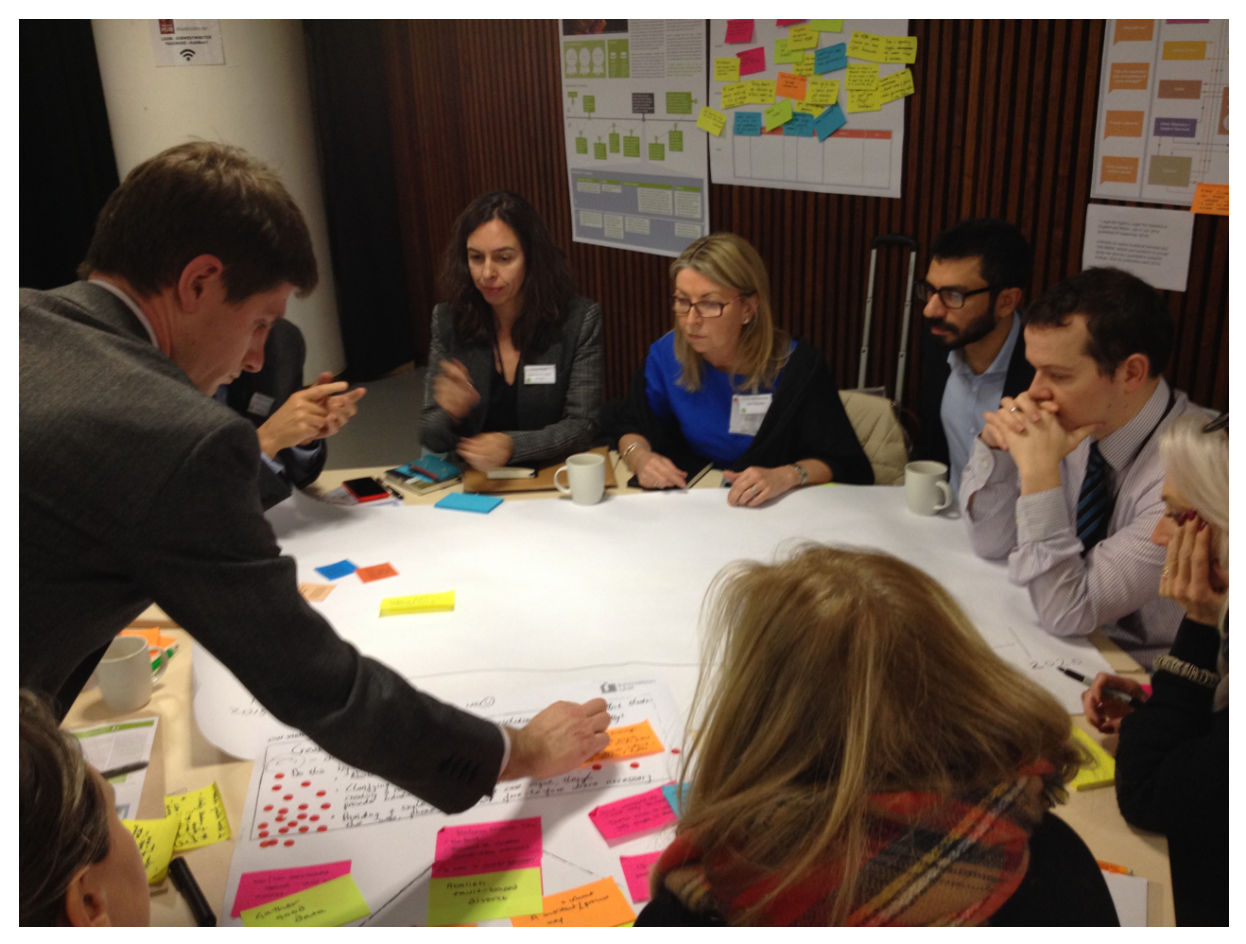
Figure 1 Photo from Policy Lab/Innovation Unit system redesign workshop showing a mixed group of participants from different backgrounds collectively generating a vision for the future of family mediation.

The MOJ policy team were familiar with the issue and many of the actors in it. For them, the value of the workshop was to convene a new way of working which resulted in a re-ordering of the policy arena. Instead of the sometimes antagonistic engagements between civil servants and some actors in this sector, this workshop engaged participants in a collaborative, open way of working which, convened by Policy Lab and an independent consultancy, to produce what some of the civil servants referred to as a "neutral space" in which they could explore the issue together.